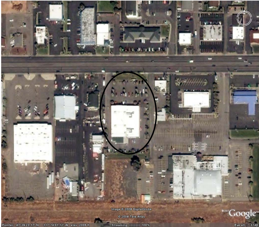
Areal view of property